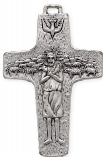
Pope Francis' pectoral cross depicts the image of the Good Shepherd

There are already many opportunities for teachers to explore what it means to be a leader in an education environment. Courses and qualifications that prepare staff to lead from the classroom all the way through their career to the post of leadership of the whole school are available in local authorities, through universities and in partnership with the Scottish College for Educational Leadership. However, there are few opportunities to explore the Vocation of the teacher and the personal response to being called to teach, called to catechise, to witness, lead and accompany young people. During 2018, SCES will launch the "Good Shepherd Pathway", a vocational leadership journey that accompanies teachers in their discernment of that personal call to leadership. The pathway will offer experiences and opportunities for personal prayer and reflection, opportunities to understand the vision and values of Catholic Education, knowledge of Church teaching and the chance to become familiar with the Catholic school system internationally.