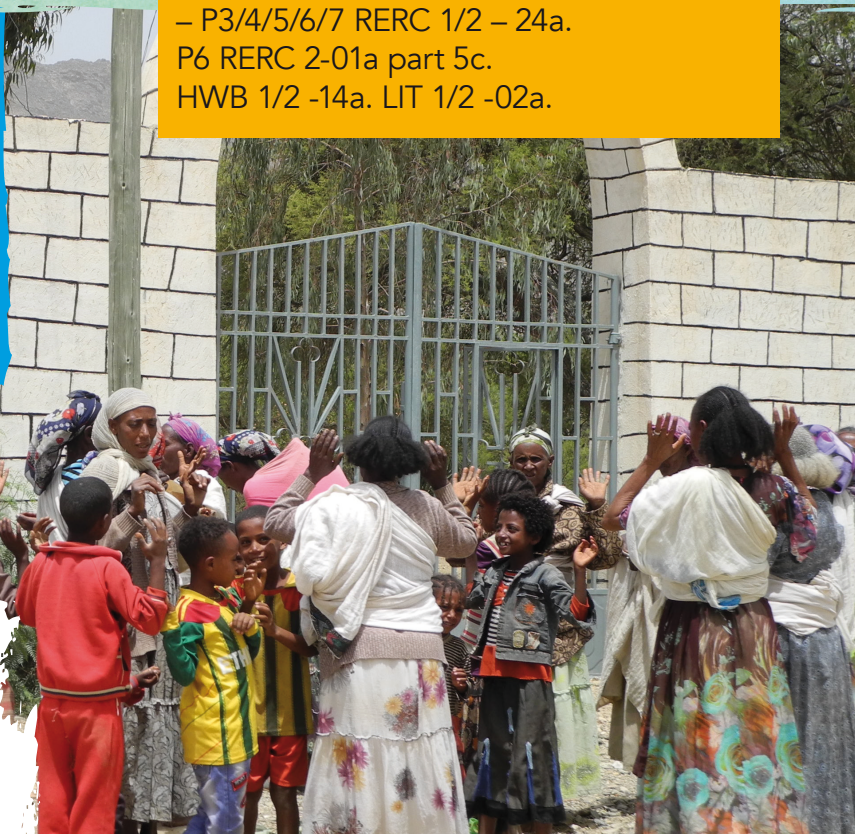
'Ladies and children from Sebaya meet to pray for the rain outside their church'