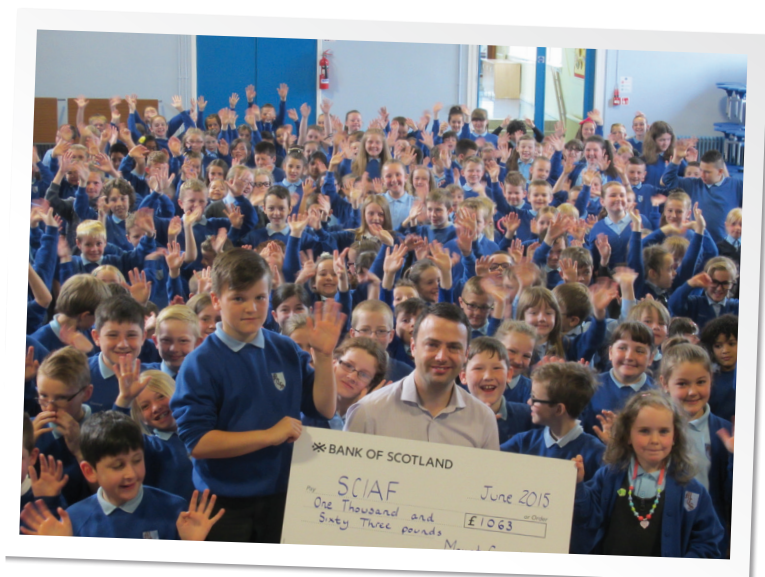
Mount Carmel Primary, Kilmarnock

Your support in giving, reflecting and acting is vital to our work in building a just world.